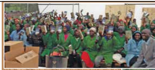
Preachers receiving Bibles.

The offerings were all short and sweet, but those present had a heart to give and when presented with a need to raise $104,000 to pay for three trailer loads of paper, God's people responded quickly and generously with offerings and pledges of over $130,000. The icing on the cake was the three precious souls who trusted Christ! We thank and praise the Lord for His presence and bountiful blessings upon His Word, this conference and this ministry! I told you it was a "humdinger!"